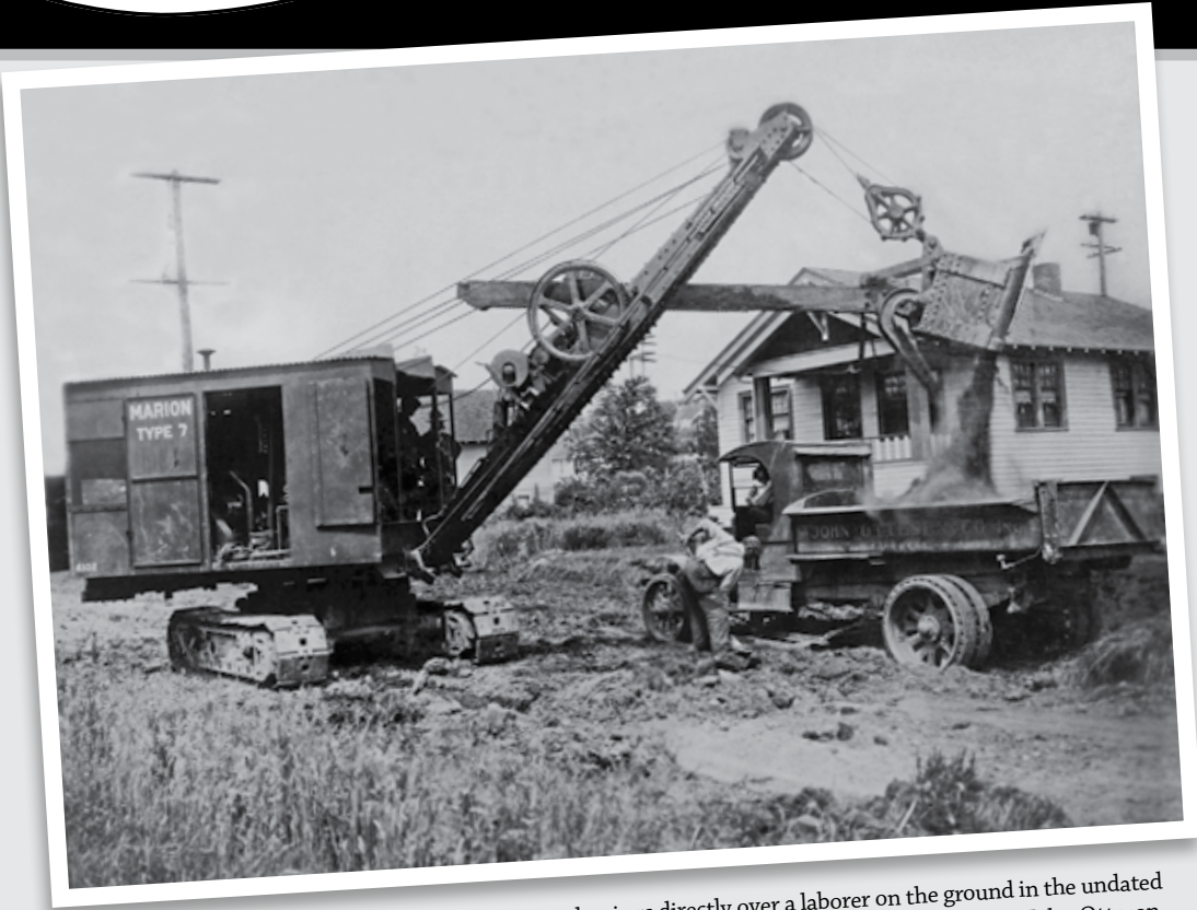
February Photo - Safety first! A Marion Type 7 shovel swings directly over a laborer on the ground in the undated image. The Type 7 was rated at one yard capacity, and 247 were produced from 1926 through 1929. John Otteson Company is the contractor.